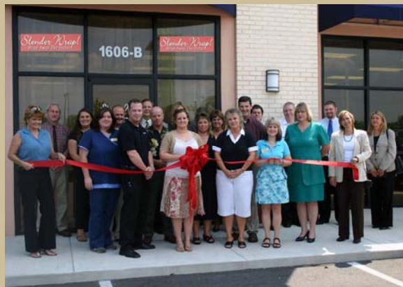
Slender Wrap Ribbon Cutting on August 22nd