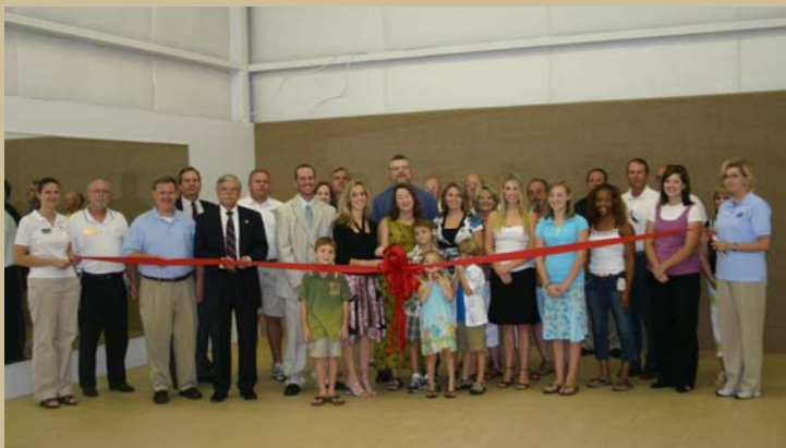
Dance Magic Ribbon Cutting on August 17th