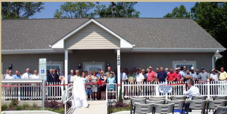
Martin Marietta Aggregates Ribbon Cutting on August 10th