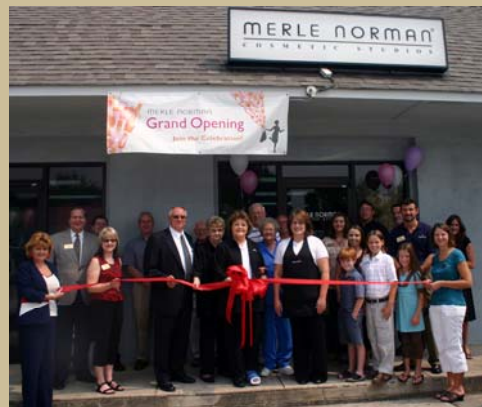
Merle Norman Ribbon Cutting on August 31st