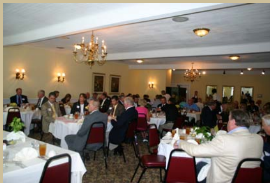
Annual Congressional Luncheon on August 16th