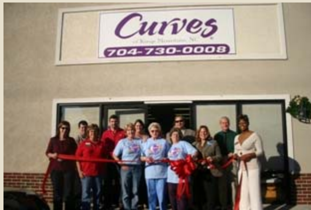
Curves of Kings Mountain Ribbon Cutting on November 30th