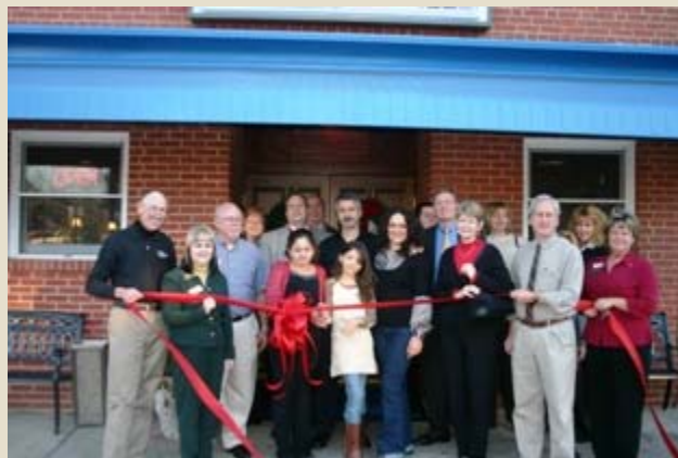
Georgios Mediterranean Restaurant Ribbon Cutting on December 3rd