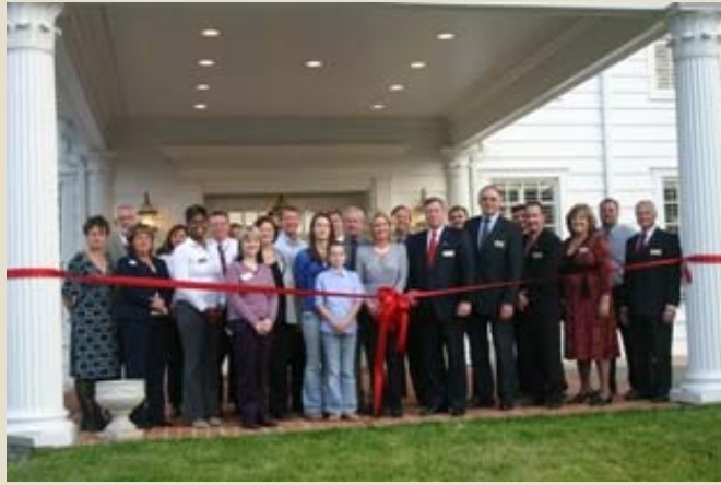
Cecil Burton Funeral Home & Crematory Ribbon Cutting on November 14th