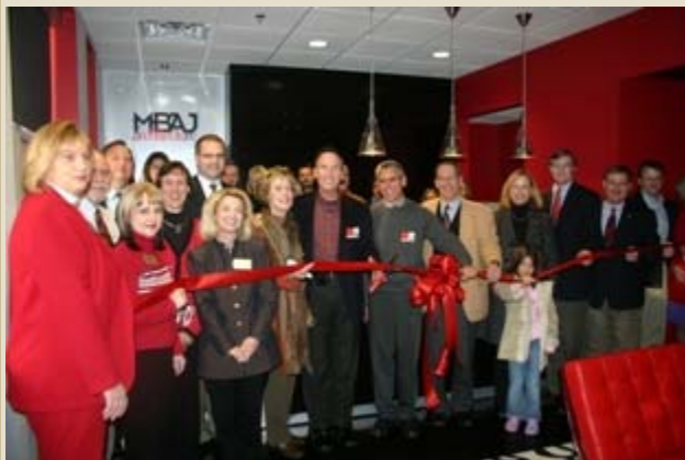
MBAJ Architecture Ribbon Cutting on December 6th