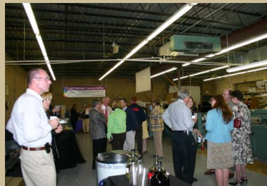
Westmoreland Printers hosts Business After Hours on April 19th