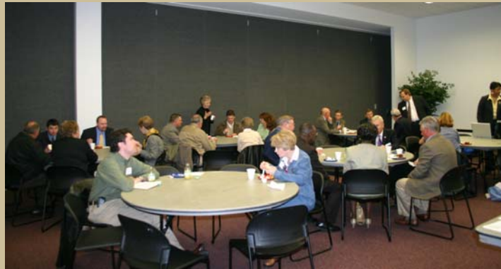
Boiling Springs State of Community Breakfast on April 5th