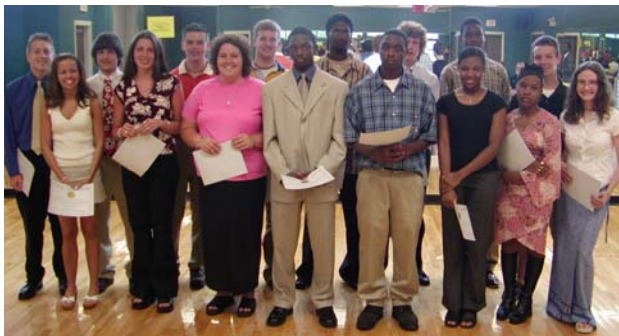
Youth Leadership Cleveland's inaugural class graduated from high school in 2004.

The mission of Youth Leadership Cleveland is: to identify Cleveland County students with leadership potential; to provide them with stimulating programs that will cultivate, nurture,