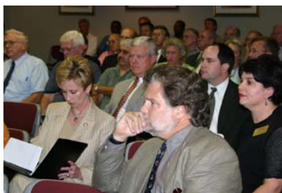
Economic Impact Meeting on August 9, 2004

The positive economic impact study examines how the Economic Development Plan of Action would affect the county, assuming the goals for investment and job creation are achieved. Both reports include direct, indirect, and