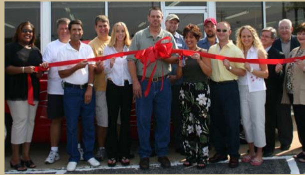
Big Papa's Tire, 1715 E. Dixon Boulevard, Shelby August 09, 2004