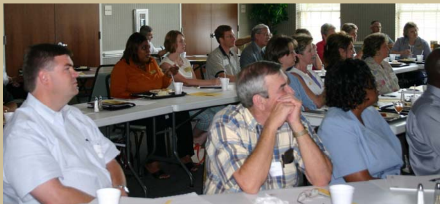
Small Business Council's "Lunch-n-Learn" at Neal Senior Center August 26, 2004