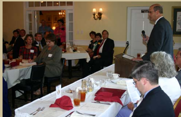
Congressional Luncheon at North Lake Country Club August 19, 2004