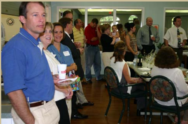
Business After Hours: Life Enrichment Center-Kings Mountain August 12, 2004