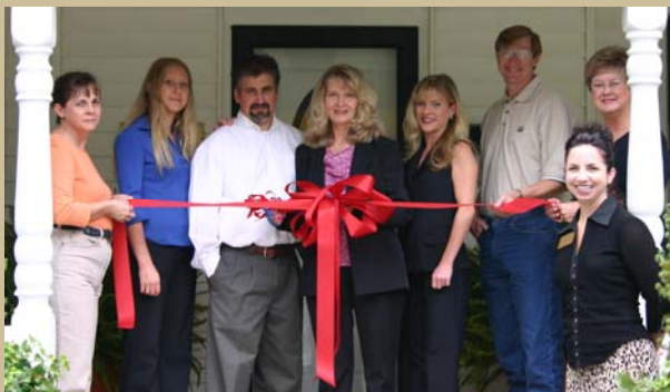
Manelines Boutique, 1100 S. Washington Street, Shelby August 15, 2004