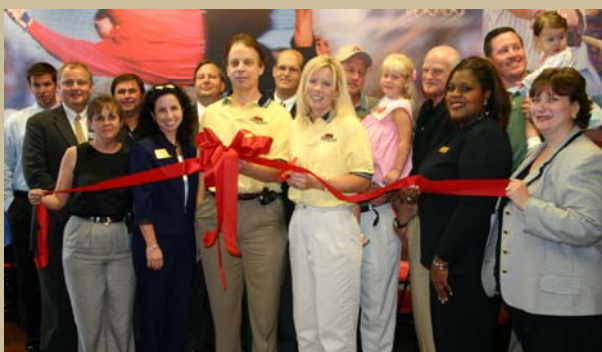
Papa's Pizza To Go, 1011-2 Grove Street, Shelby August 24, 2004