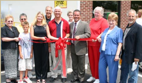
Stateline Dollar Store, 218 S. Main Street, Grover July 29, 2004