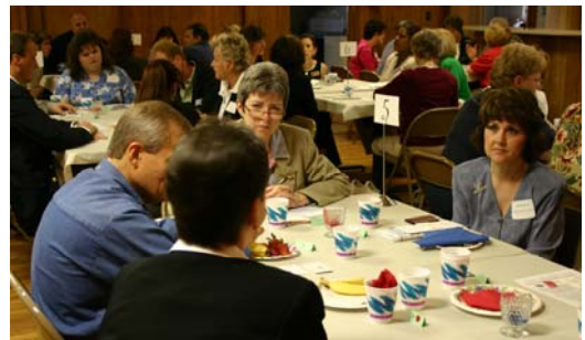
Business At Breakfast was held at Shelby AmVets on April 29, 2004.

Participants walk away from this event excited about the business prospects they've gathered and looking forward to future opportunities. Don't miss our next Business at Breakfast event, which will be held at Shelby Savings Bank , located at 224 East Warren Street in uptown Shelby on Friday, September 24 at 7:30 a.m. If you are interested in attending or sponsoring a future event, call the Chamber at 704-487-8521.—From the Membership Services Division