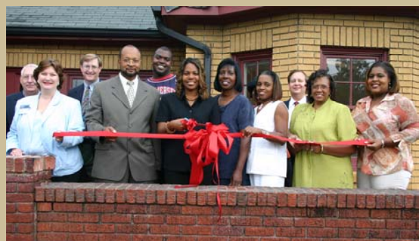
DeVoe Realty, 405 East Marion Street, Shelby August 26, 2004