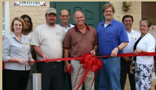
Trade Street Eatery, 103 North Trade Street, Shelby August 23, 2004