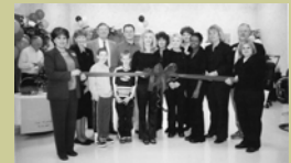
Ribbon cutting for Talk of the Town Salon & Spa in Boiling Springs on January 13.