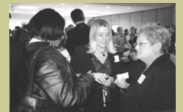
Business After Hours at Shelby Savings Bank on January 15.