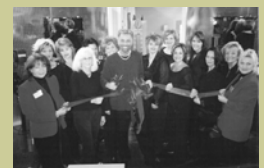
Ribbon cutting for Trendsetters Salon & Spa in Shelby on January 15.